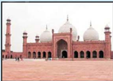
Badshahi Mosque Lahore