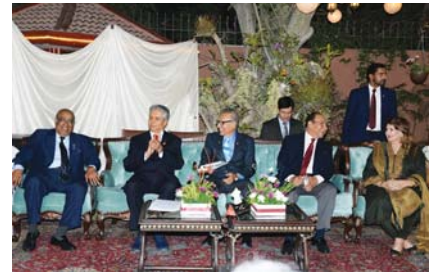
Sharing a moment of hilarity.