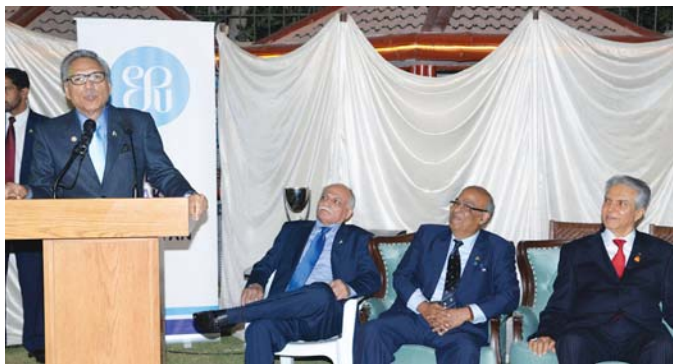
President of Pakistan Dr. Arif Alvi addresses ESUP Annual Dinner Meeting