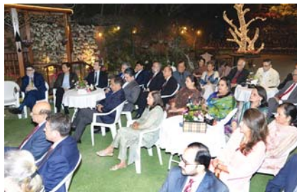
A view of the gathering at the ESUP Dinner Meeting all ears tuned to President of Pakistan Dr. Arif Alvi.