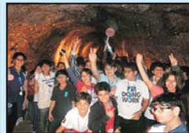
Khewra Salt Mine

Karachi 021 32411204 021 32415043 G.L. 67