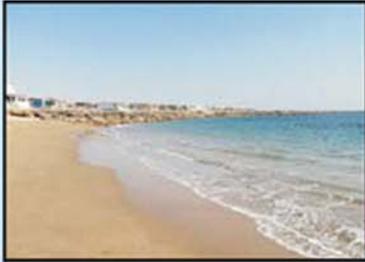
Karachi French Beach