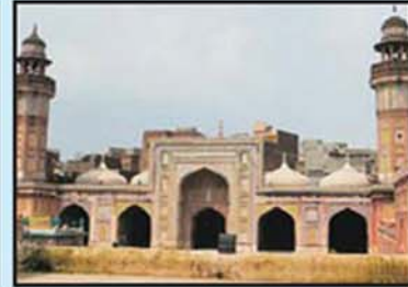
Wazir Khan Mosque Lahore