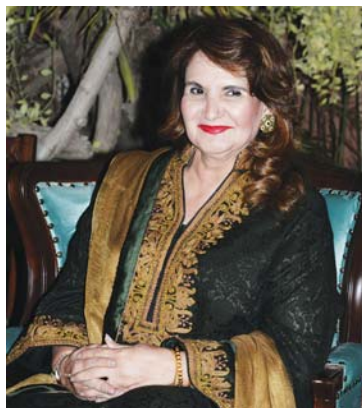
First Lady Samina Arif Alvi

To complete the magic of the evening, the meeting was addressed by the Chief Guest, who was none other than the well loved and respected honourable President of Pakistan, Dr. Arif Alvi. The President of ESUP welcomed the President of Pakistan with warm words tinged with the light hearted familiarity of a long association. It was similarly reciprocated by the President in his address. No stranger to the ESUP, he lauded the great effort made by the organization to provide a platform for such meaningful, interactive discourses and for grooming the youth into the art of oratory.