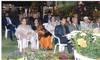
A view of the guests and the beautiful garden.