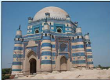
Tomb of Bibi Jawindi