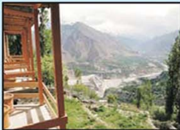
Duikar Altit Hunza